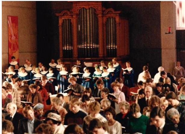
Dedication of the “new” Hamill organ in 1985.