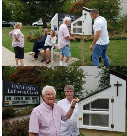
The ULC Book Nook is located near the bus stop in front of the church.

The library will contain adult Bibles, children's Bibles, Christian fiction