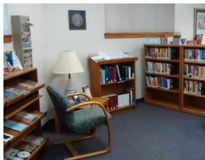
The ULC Library received a makeover this summer.