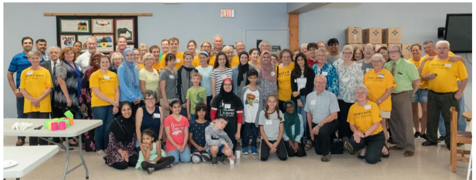
Harrison Road neighbors from the Islamic Center, University United Methodist Church and ULC joined together to pack 10,000 dehydrated meals on Sept, 22.