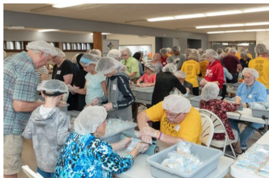
Rice, dehydrated vegetables, protein powder, and vitamins are packaged to feed three adults.