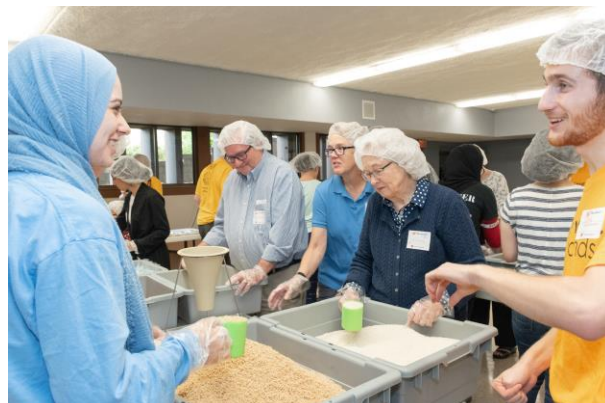
10,000 meals packed by interfaith neighbors.

A Lutheran, a Muslim and a Methodist walked into a Fellowship Hall – and did great things together to feed hungry people! For the fifth time in as many years, members from ULC and our next-door neighbors at the Islamic Center worked together to package over 10,000 dehydrated meals. And for the first time (and we hope this is the beginning of a long tradition), we were joined by our other neighbors from University United Methodist Church.