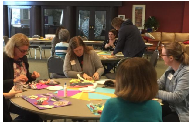
Using paper, ribbon and glue sticks to express Psalm 46.

On a sunny Saturday in early April, 18 ULC women and guests met at Okemos Presbyterian Church for a one day retreat. They were encouraged to “Be Still” and listen for God. Using Lectio Divina, a traditional way of listening to the word of God in Scripture, the group explored Psalm 46.