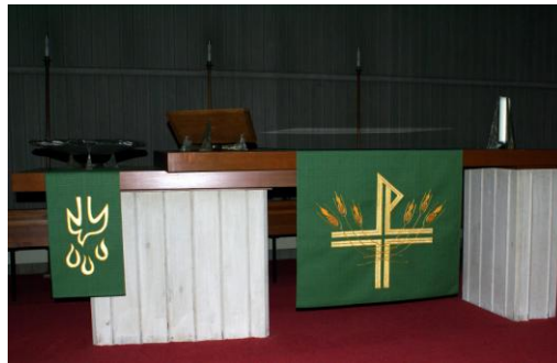
The Trinity is represented in the altar furnishings.