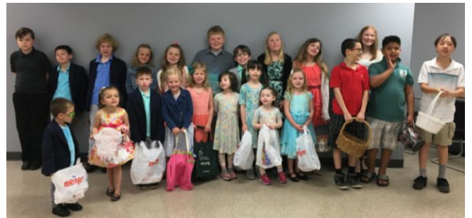
Happy Easter egg finders!