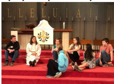
Helping with worship

Second, I could not have planned and coordinated the activities we did without the help and support of each of the parents. They woke their child