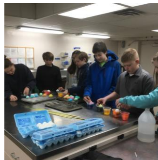
Making Easter breakfast

Lastly, thank you to the pastors and congregation for the prayers, support, and guidance. The excitement and backing from the congregation was