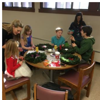
Creating Advent wreaths

First, thank you to the youth for trusting in me. I remember being warned that the youth are very shy and quiet, so I would have to plan accordingly. I promptly decided to ignore the warnings and encouraged full participation by everyone. At times, the youth were hesitant (and