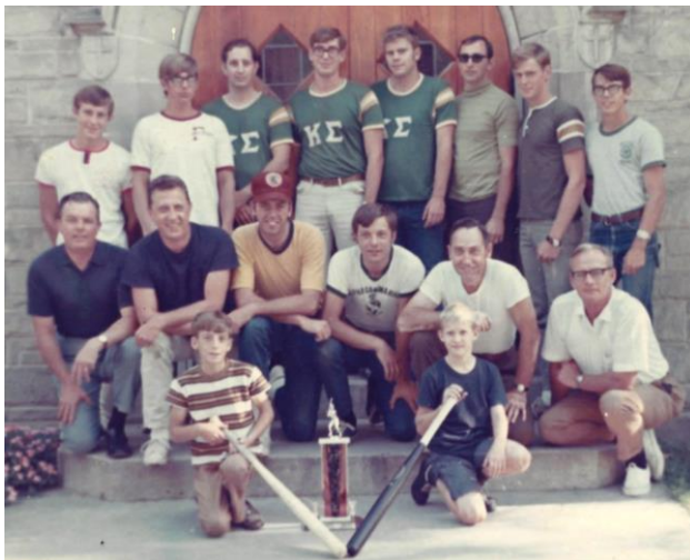
The U-LUS Slow Pitch Softball Team