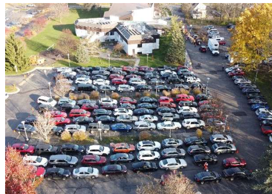
Many of the 362 families served during the November food distribution.

ULC distributes food for the Greater Lansing Food Bank each month. The way we distribute food each month has changed radically because of the Covid pandemic. We now operate drive-through distribution, where the shoppers remain in their vehicles. We had a few hiccups with traffic flow at first, but now have a systematic plan for lining up cars in the main lot before directing them past food stations near the entrance to the church.