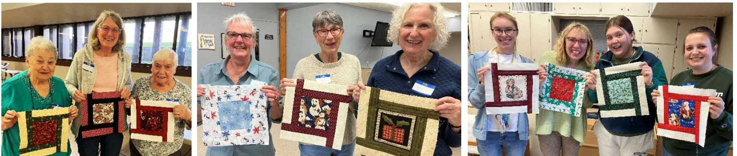
Participants at the Nov. 11 Christmas Quilt-a-Thon show off the blocks they created using donated fabric.