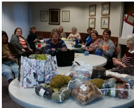
Tight Knit celebrates two years together!