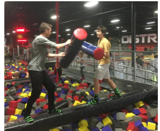
Bonding at District 5 Trampoline Park →