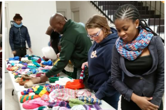
260 Hats were handed out at Food Movers.