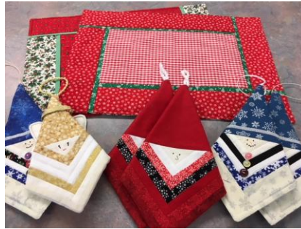
Placemats and Santa ornaments made during the Fun Day on Nov. 11.