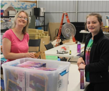
Sorting materials at the new nature center.