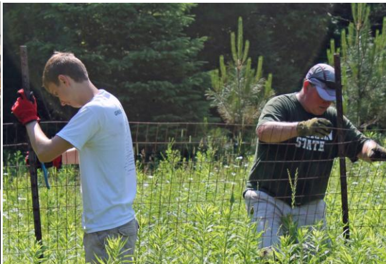
Clearing fencing at the Pictured Rocks Nature Center.