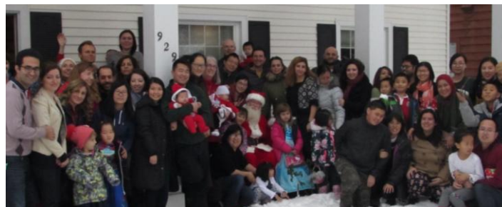
Christmas activity at Friendship House MSU

Friendship House MSU (FHMSU), located just one block south of ULC at 929 Sever Street, is a Gospel-centered ministry of friendship and hospitality that serves international students at MSU and their families in this situation. FHMSU is organized and supported by Lutheran churches in the Lansing area. A core mission of FHMSU is education, with more than 25 course opportunities for international families in conversational English, Christianity and basic bible study, special thematic courses such as sewing and knitting, and a variety of special events that introduce participants to American culture.