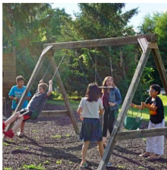
Fellowship on the swings