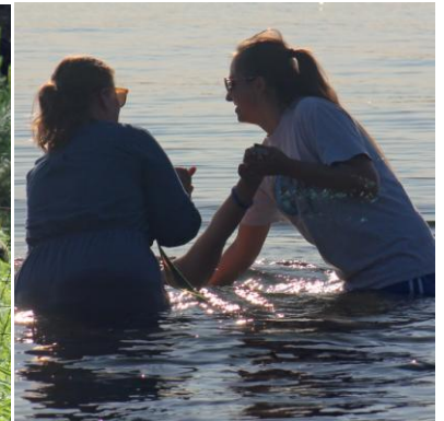
Baptism in Lake Superior