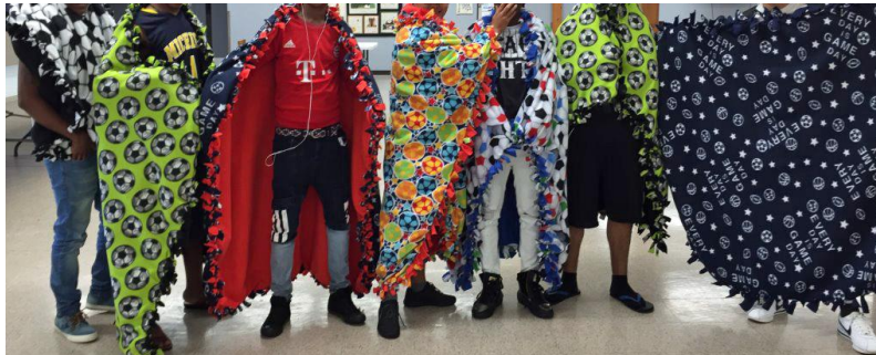
Youth from Samaritas summer program show off fleece blankets they made.

July 19 found a group of youth from the Samaritas summer program working with volunteers to make tied fleece blankets after a pizza party lunch. This is the second year we have helped teach a group of enthusiastic young men how to make these blankets. They were each able to take a blanket with their name on