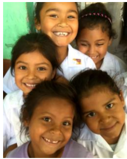
Smiling faces showing off beautiful teeth.

Many years ago the Honduran Lutheran Church (HLC) leaders had a vision for a sustainable health project for their communities. Working with members of the N/W Lower Michigan Synod that vision became a reality in 2005 with the beginning of Health for Life . During mission trips members of the N/WLM Synod join HLC leaders in training local Honduran volunteers to address basic but holistic health issues in their own villages. These volunteers are a constant presence in their communities and minister and assist their neighbors whenever needed. This ensures that the target communities are served year-round with relevant care.