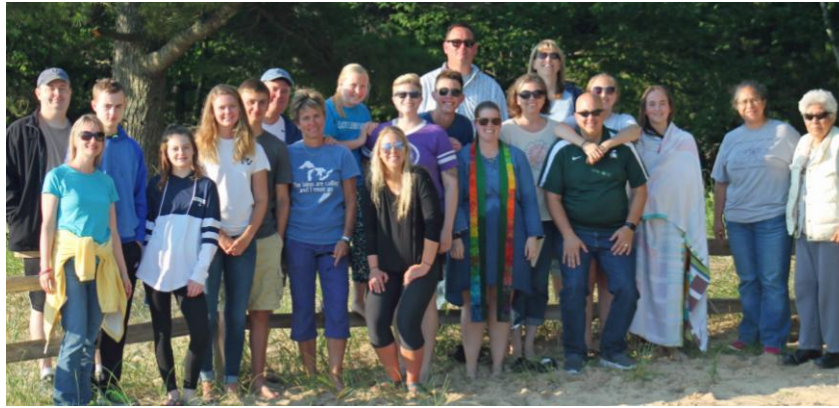
Multigenerational group serve at Pictured Rocks National Lake Shore.

On Monday morning, everyone got to work clearing wire fencing and fence posts, building benches, digging up the Burdock weed that had taken over the landscape, painting, sorting, organizing, cutting, and cleaning. The weather wasn't