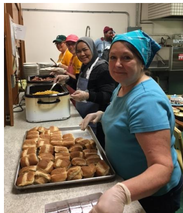
Sign up in Sept. for the next Soup Kitchen event.

Please prayerfully consider volunteering this year! Preparation begins at 9:30 a.m. and