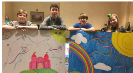
Some of the posters the youth made at the Charge event in Traverse City.

The following week Pastor Gary Bunge and I took four youth to Great Wolf Lodge near Traverse City for a weekend filled with service,