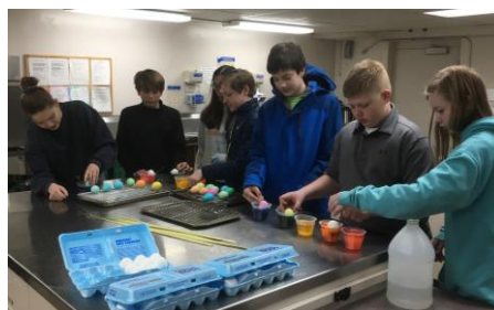
Coloring eggs for Easter breakfast.

swimming, song, worship, laughter, and so much more. The weekend left me with a lack of sleep, but also a renewed sense of faith, and connection to those we joined. I hope the youth found the same. Thank you to those who prayed for us.