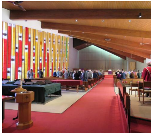
Architect explains unique ULC sanctuary.

The imposition of these two axes on what otherwise would have been a more traditional rectilinear nave and chancel space, plus the desire to generate a more naturally flowing space in the course of entry into the Church, resulted in the angularity of the plan. The two axes also led to the generation of the hyperbolic paraboloidal roof. The point of equal height on the timbers flows in line with the visual axis and the high