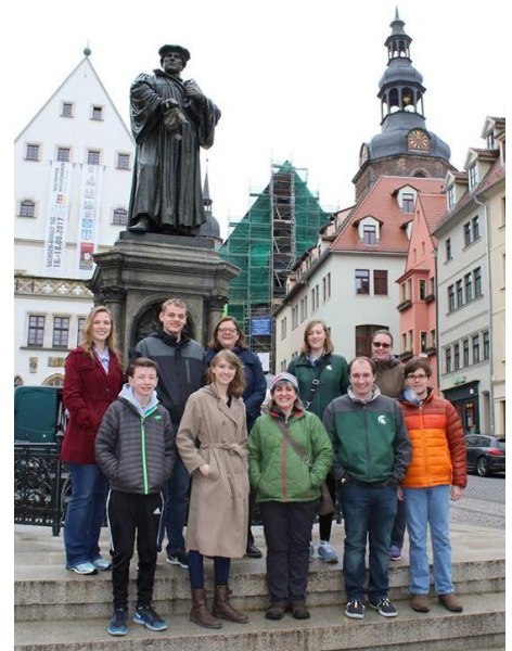
Spring Break travelers stop for a photo in front of Martin Luther in Wittenberg.